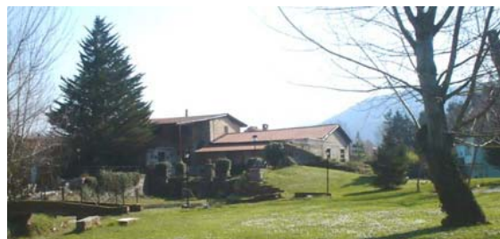
The Old Mill Camp

It all started with a flood in 2005 – not in the Northwest but in Italy.